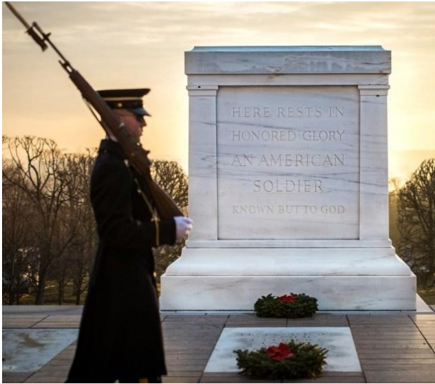
Tomb of the Unknown Soldier Arlington National Cemetery

HERE RESTS IN HONORED GLORY AN AMERICAN SOLDIER KNOWN BUT TO GOD